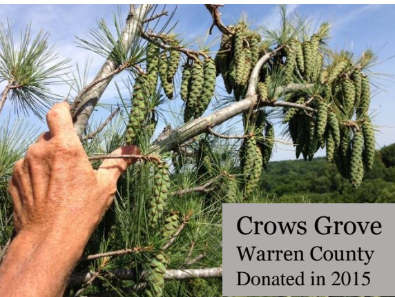
Crows Grove Warren County Donated in 2015