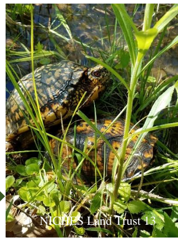
NICHS Land Trust 13

Box turtles sighted during NICHS BioBlitz 2017 at Black Rock Barrens!