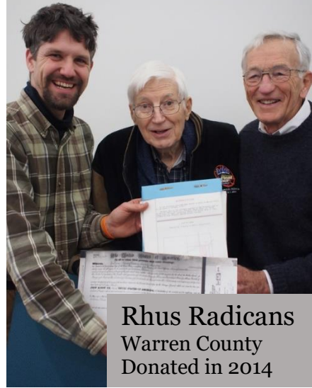
Rhus Radicans Warren County Donated in 2014