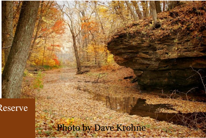
Wright Rock Creek Nature Reserve Warren County Donated in 2001