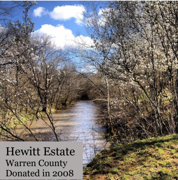
Hewitt Estate Warren County Donated in 2008